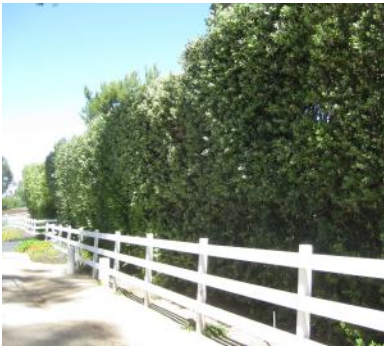
Shorten shrubs to be no taller than the item screened

For shrubs directly adjacent to structures, the following types of actions can meet fuel management goals: