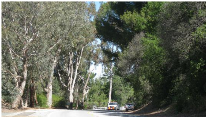
The row of trees on the left are more fire-safe than the ones on the right because of the arrangement of the lower branches and the density of the trees. The trees on the left have most lower branches removed, and the density of the vegetation is less.

When these trees are used for privacy, match the tree size with the item to be screened so they do not unnecessarily block views. Crown thinning is advisable for fire safety only when there is an avenue for fire to reach the tree crown. Shrubs and short trees serve better as screening material than larger trees