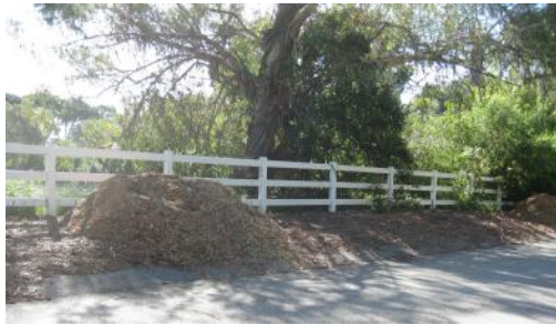
Spread chips to be no more than 4 inches deep.

Compost, mulch, or dispose offsite all vegetation materials cut during fuel treatments. Cut material may either be chipped and spread so the chips are no deeper than 6 inches. If cut materials are not chipped they must be hauled from the site.